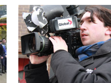
Job cuts at Global News stations diminish Canadian news coverage as the federal government continues to allow internet giants to drain needed ad revenue out of the country.