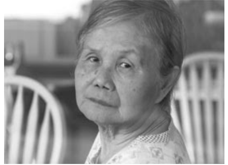
Unifor, CUPE Ontario and SEIU Healthcare collaborate to call for an end to for-profit longterm care after COVID-19 proves far more deadly in profit-driven facilities.