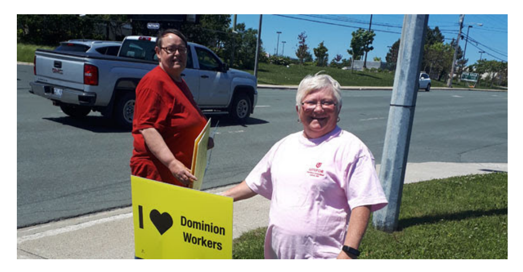
Strike deadline approaches for Newfoundland Dominion grocery workers as negotiations for a fair collective agreement go down to the wire with Loblaw Companies Limited.